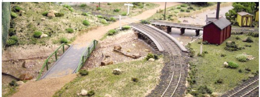
US-50 and the wye cross the Cimmaron River.

The depot, restaurant and hotel in Cimmaron, CO circa 1929, as modeled on Paul Buhrke's layout. This was when the traffic was starting to wane on the division. The hotel and restaurant are boarded up. The depot has been repainted into the new D&RG yellowish cream and brown, but other buildings have the traditional Tuscan red paint jobs which are starting to show sun-fading.