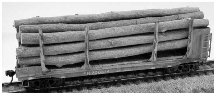
Best of Show: BN Log car #200374 By: Alan Barnes